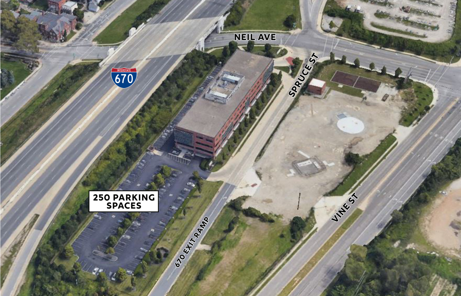
Two forms of egress/ingress*